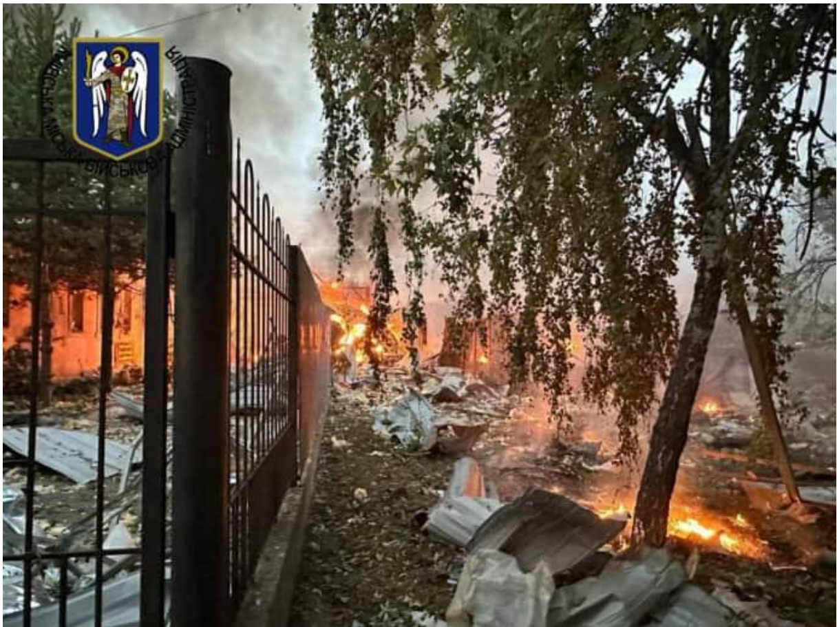
Missile pieces land in three districts of Kyiv after missile attack on September 21, firefighters extinguish fire, seven wounded