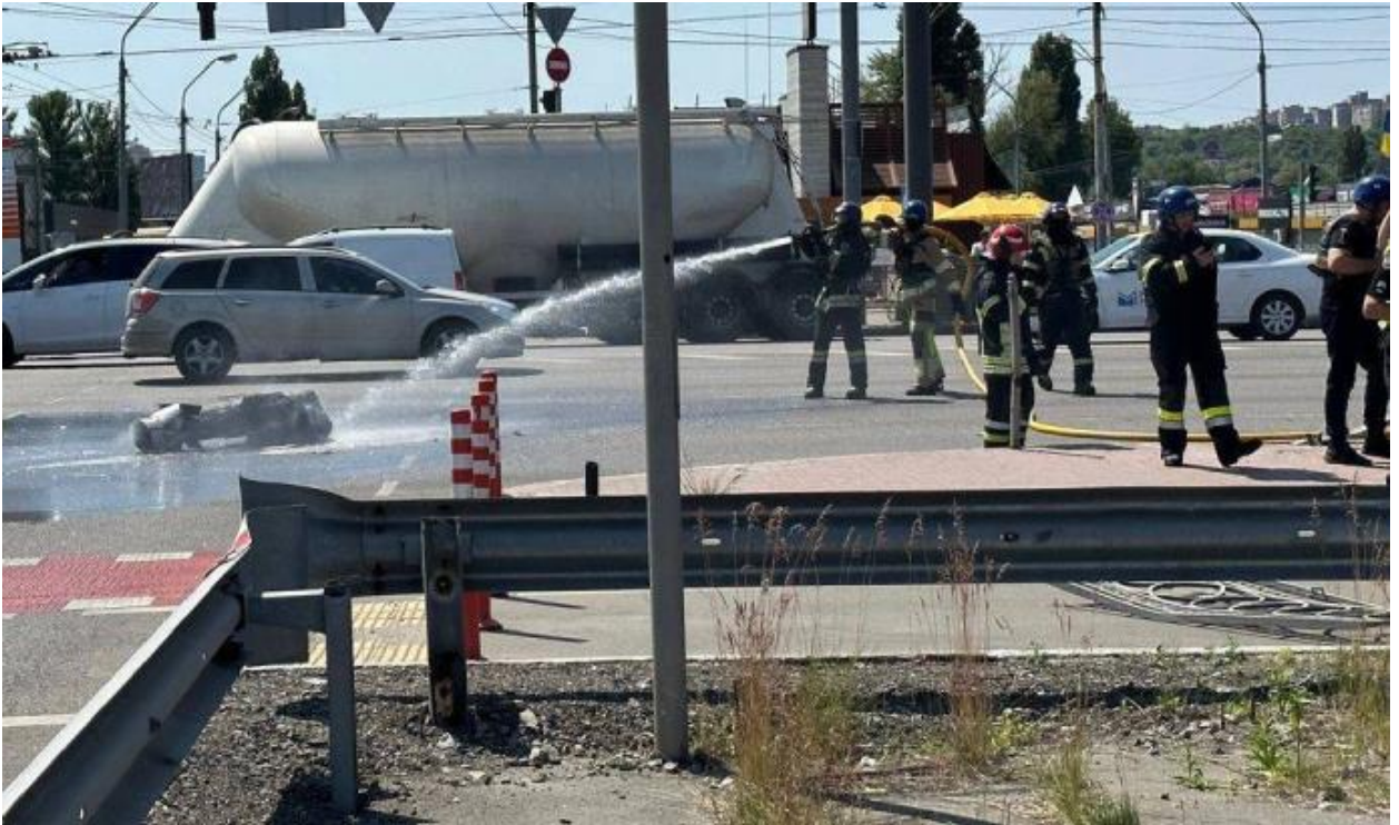
ru s sian attack on Kyiv on May 29: missile wreckage falls in two city districts, one person injured