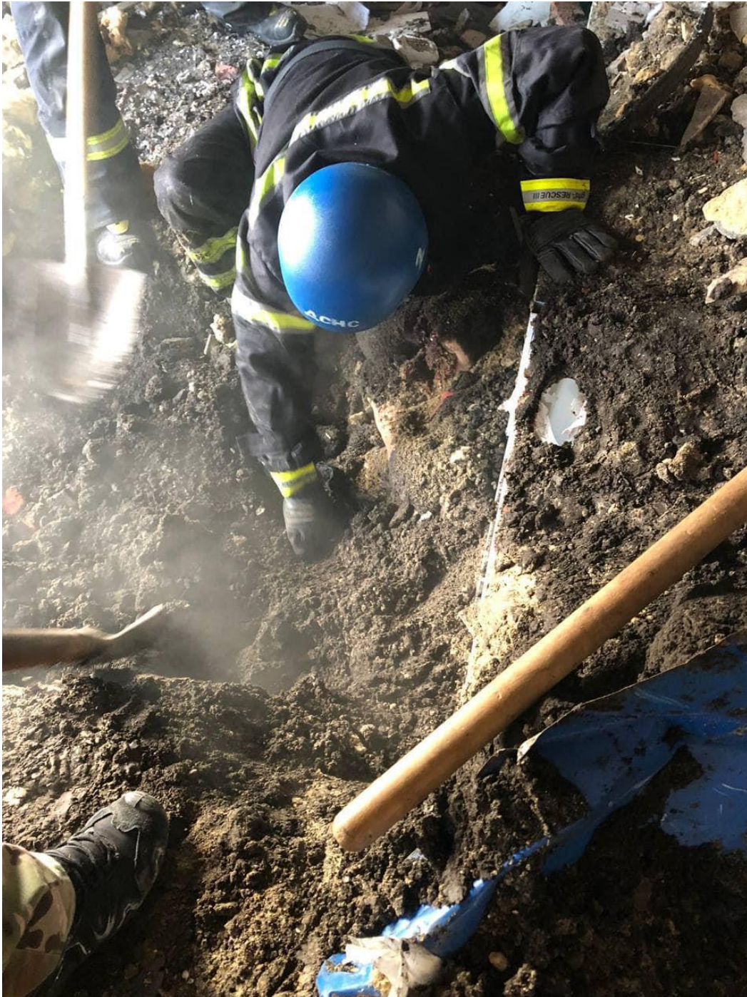
Rescuers remove people from the rubble after the Russian attack in the Kharkiv region