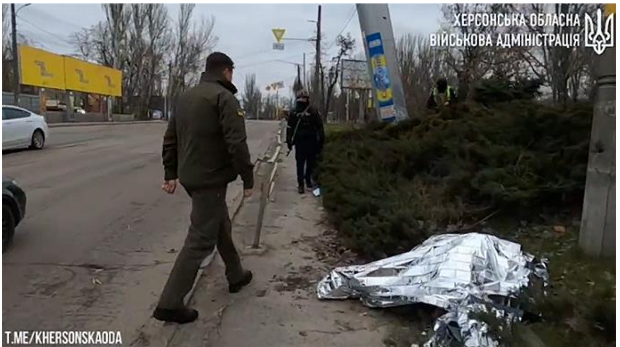
Russians hit the city of Kherson: one person killed, one injured