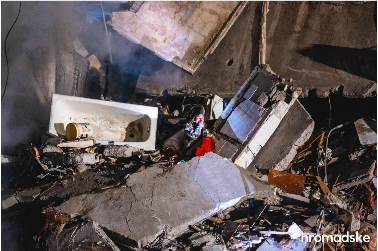
A photo that makes our hearts freeze. The girl sits on the ruins of what was her home in the city of Dnipro. She managed to survive by hiding in the bathroom