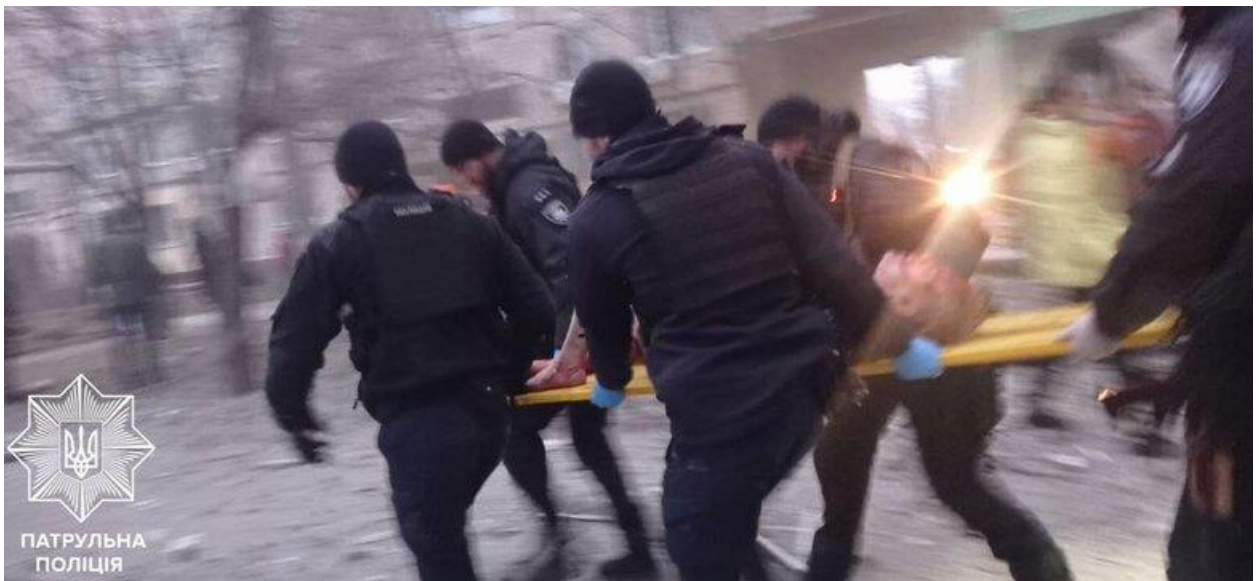
Destruction, burning cars, people screaming from under rubble: Patrol police showed footage of first minutes after missile strike on Dnipro