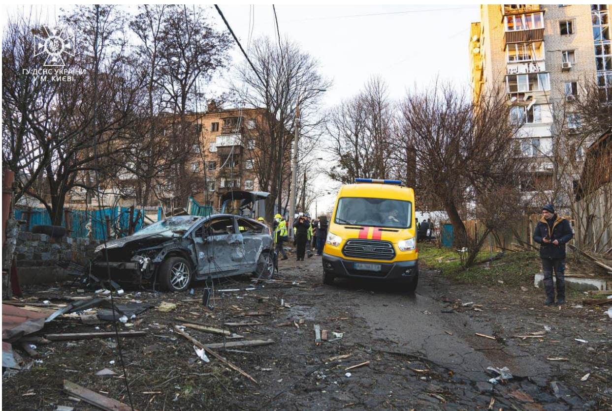
Missile attack on 31 December, 2022: one person killed in Kyiv, 22 injured, buildings damaged. Two people died later in the hospital.