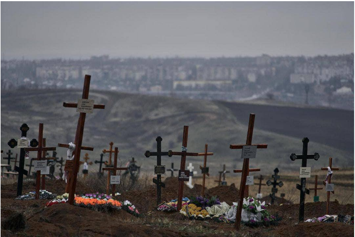
The local cemetery