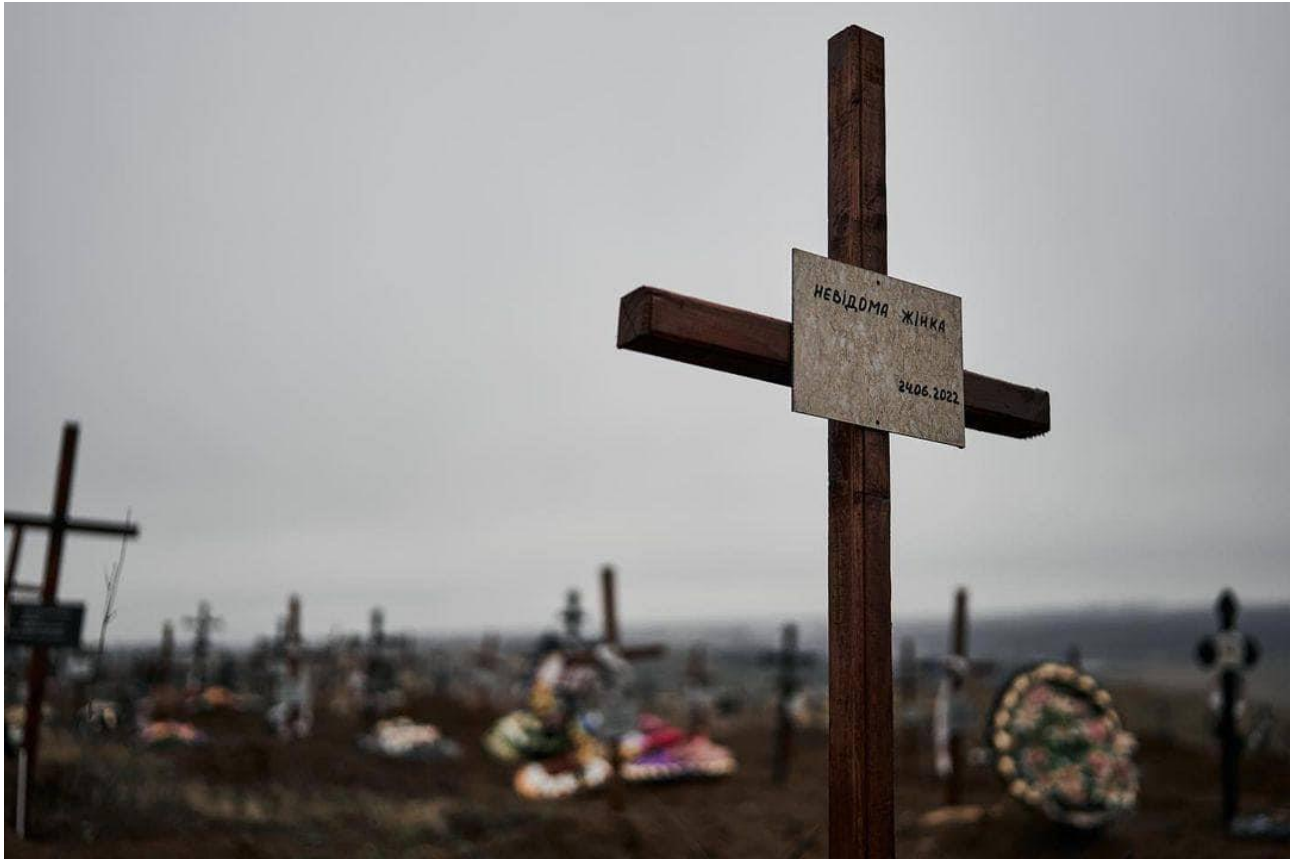
The inscription on the cross: "Unknown woman"